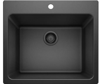
Model LX401920 shown in ANTHRACITE * basket strainer not included