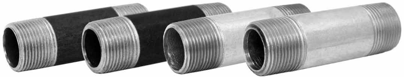
FIG. 339: Standard Black Schedule 40

Black & Galvanized, Std. Sch. 40, XH Sch. 80