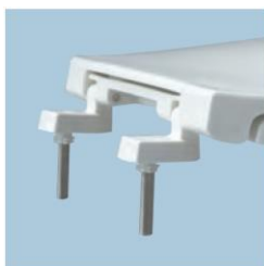
PLASTIC HINGES WITH STAINLESS STEEL POSTS AND PINTLES