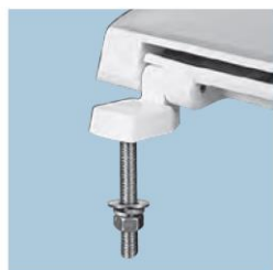
300 SERIES STAINLESS STEEL HARDWARE