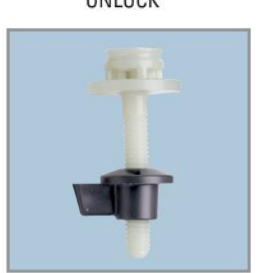
NON-CORROSIVE BOLTS AND WING NUTS