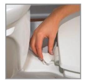
TWIST HINGES TO UNLOCK