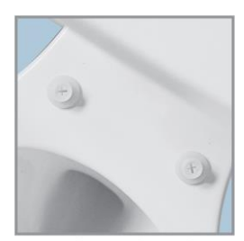
EASY REMOVAL OF SEAT FOR THOROUGH CLEANING