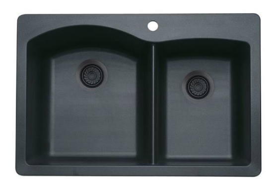
Model LX440215 shown in ANTHRACITE * basket strainer not included

LX440215 Double Bowl, 9-1/2" & 8" bowl depths, ANTHRACITE LX440213 Double Bowl, 9-1/2" & 8" bowl depths, CAFÉ BROWN LX440216 Double Bowl, 9-1/2" & 8" bowl depths, WHITE LX440217 Double Bowl, 9-1/2" & 8" bowl depths, BISCUIT LX440214 Double Bowl, 9-1/2" & 8" bowl depths, METALLIC GRAY LX442744 Double Bowl, 9-1/2" & 8" bowl depths, CONCRETE GRAY LX441283 Double Bowl, 9-1/2" & 8" bowl depths, TRUFFLE LX441465 Double Bowl, 9-1/2" & 8" bowl depths, CINDER LX442908 Double Bowl, 9-1/2" & 8" bowl depths, COAL BLACK