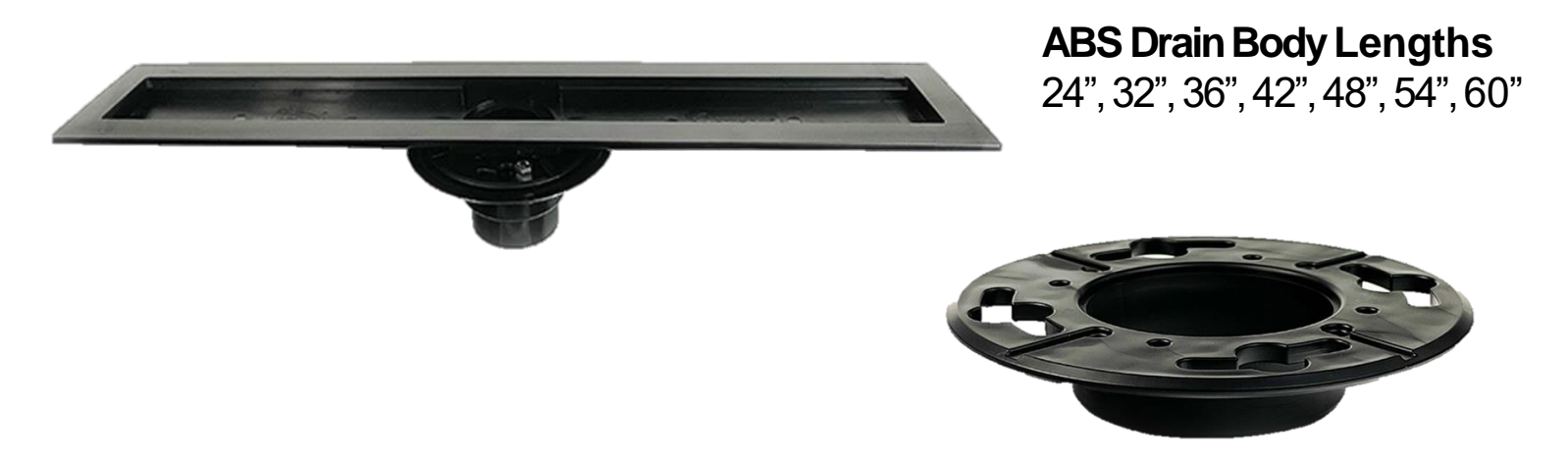
Clamping Ring Hub Transition

Provides an economical alternative to complement a single-slope shower installation using a large-format tile, thin-gauged tile, or any other tile or stone installation